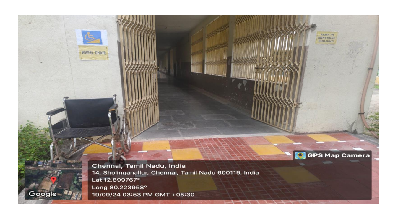
Ramp @ Annexure Main Building

Affiliated to the university of Madras & Reaccredited by NAAC An ISO 9001 : 2015 Certified Institution, Sholinganallur, Chennai -600 119.