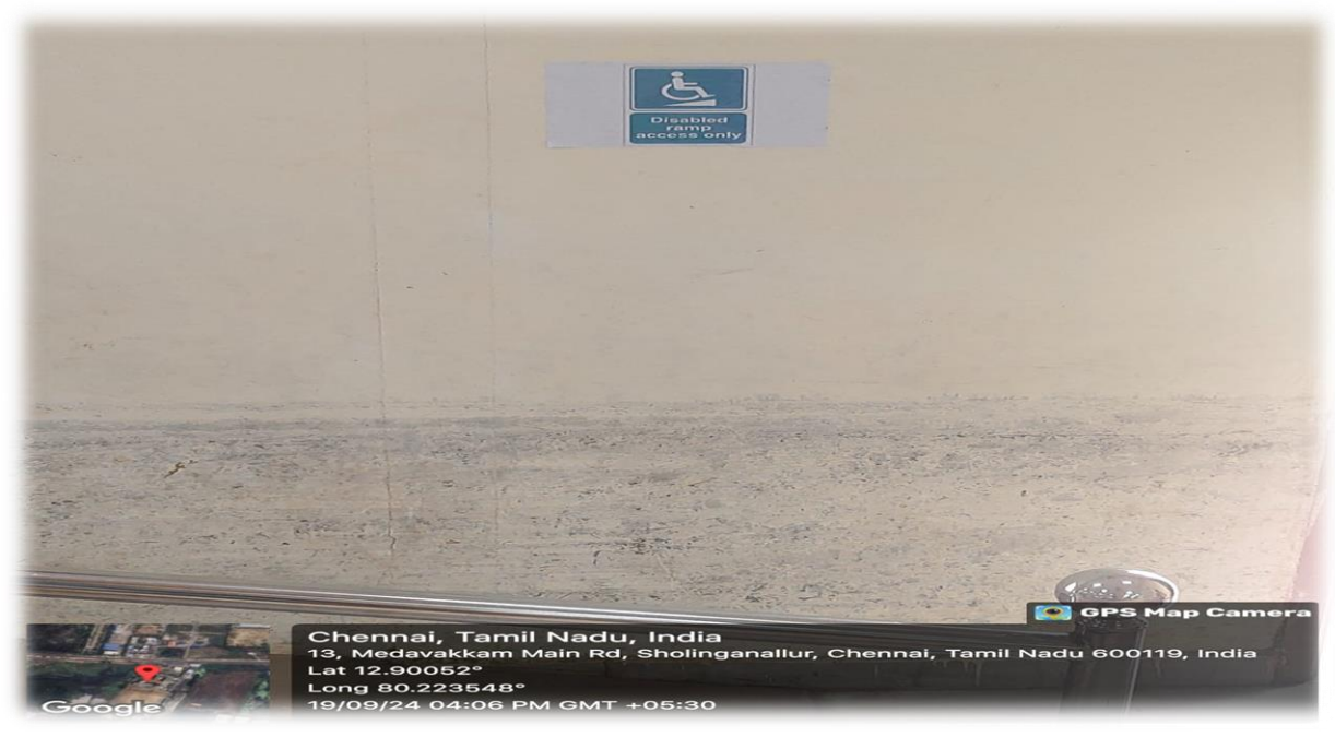
Ramp @ Auditorium