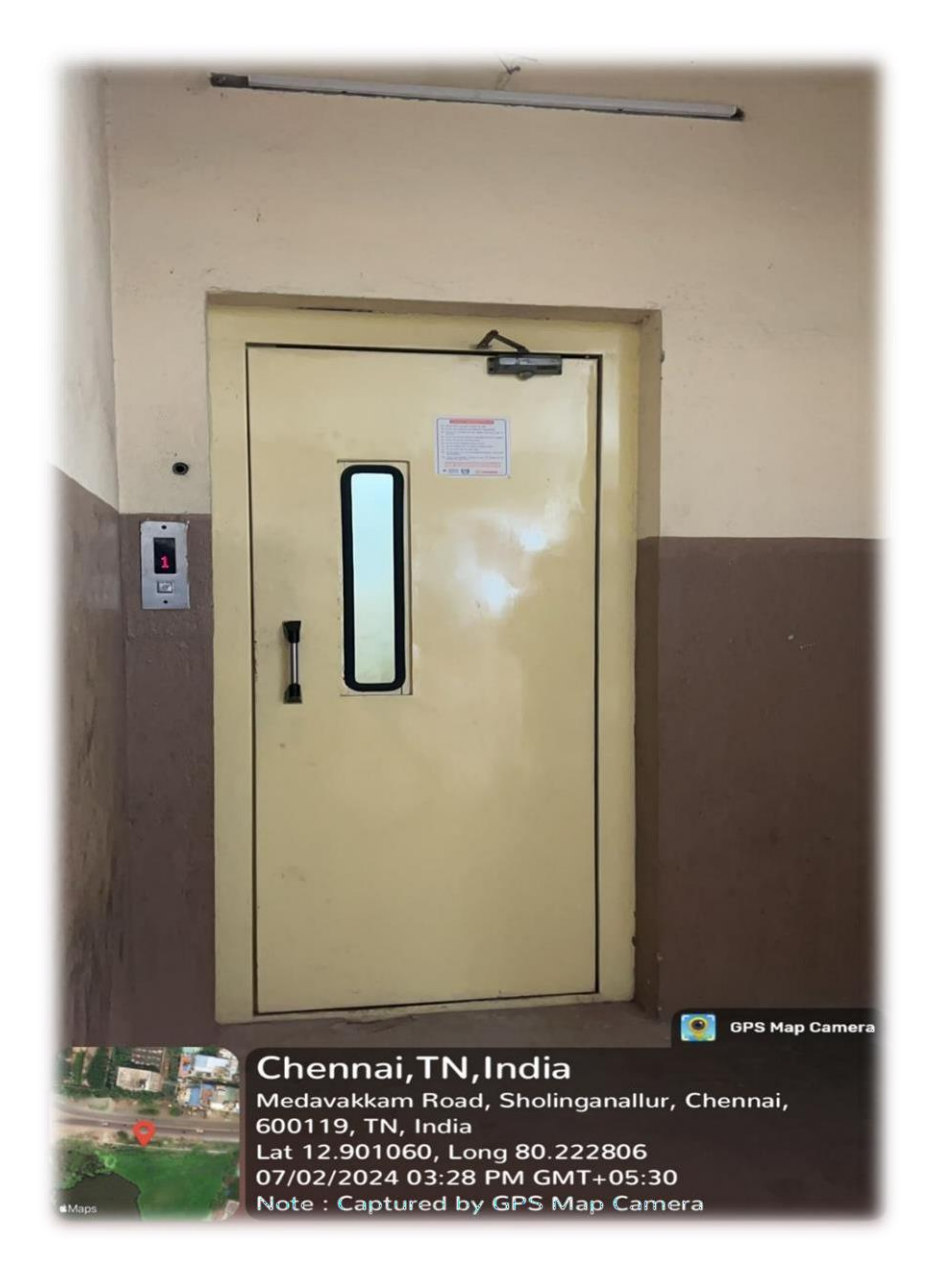
Lift @ First floor in Main building

Affiliated to the university of Madras & Reaccredited by NAAC An ISO 9001 : 2015 Certified Institution, Sholinganallur, Chennai -600 119.