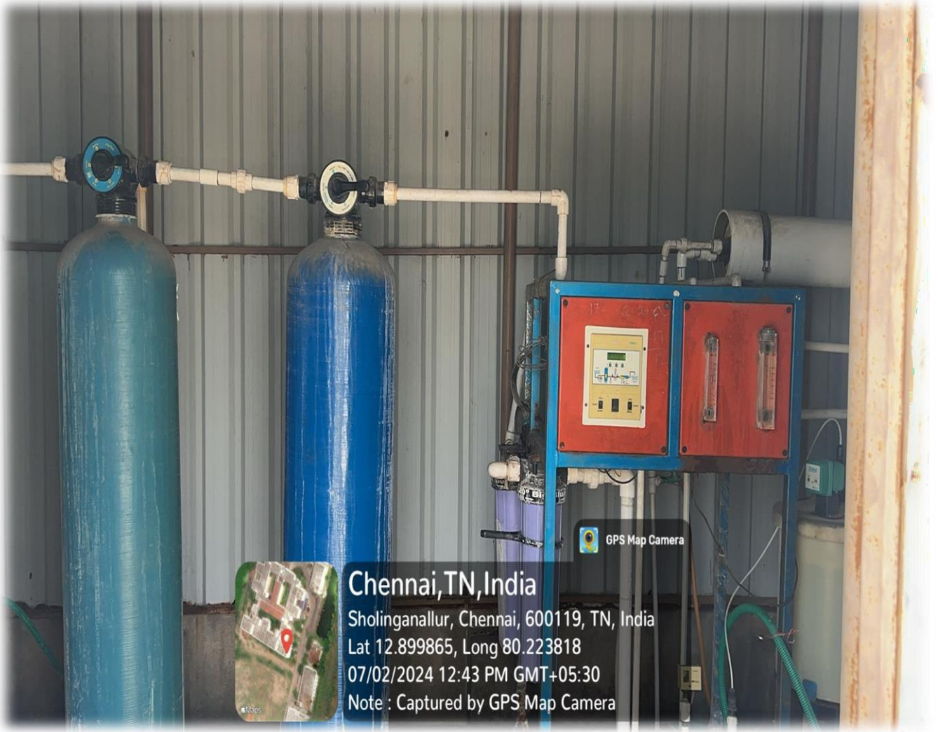
RO Plant @ Main Building

An ISO 9001 : 2015 Certified Institution, Sholinganallur, Chennai -600 119.