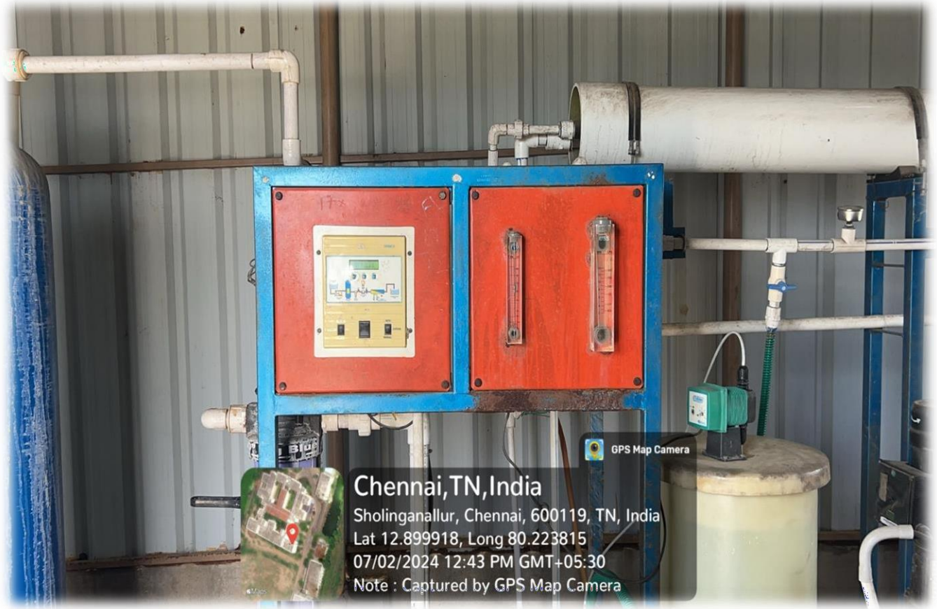
RO Plant @ Main Building

An ISO 9001 : 2015 Certified Institution, Sholinganallur, Chennai -600 119.