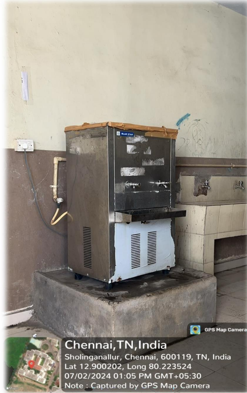
Drinking water (Cooler) Main Building III Floor

An ISO 9001 : 2015 Certified Institution, Sholinganallur, Chennai -600 119.