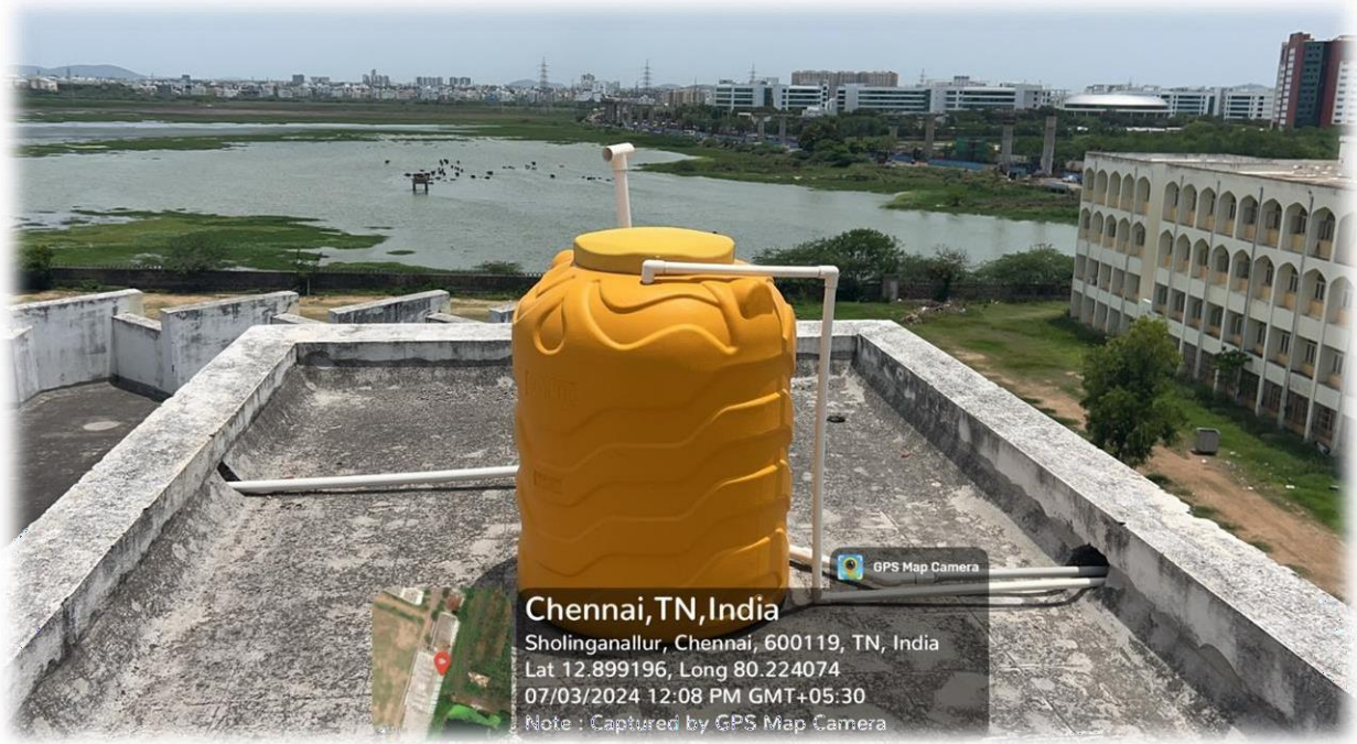
RO water tank New Building

An ISO 9001 : 2015 Certified Institution, Sholinganallur, Chennai -600 119.