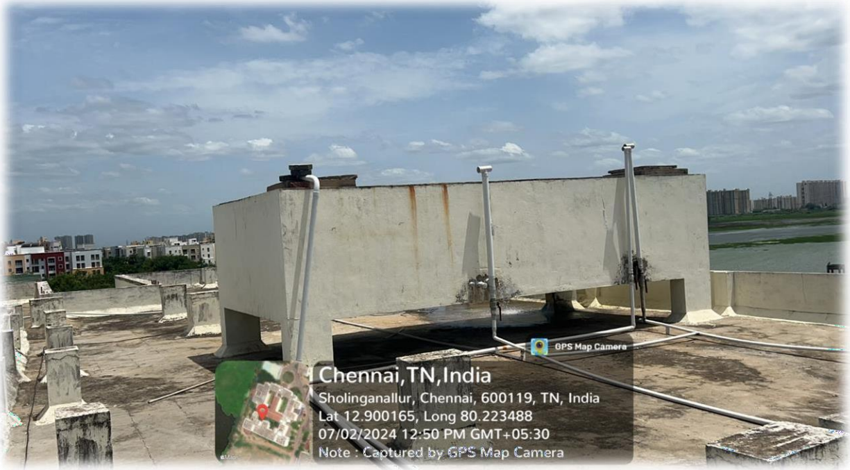
RO Plant @ water tank Main Building Annexure -2

An ISO 9001 : 2015 Certified Institution, Sholinganallur, Chennai -600 119.