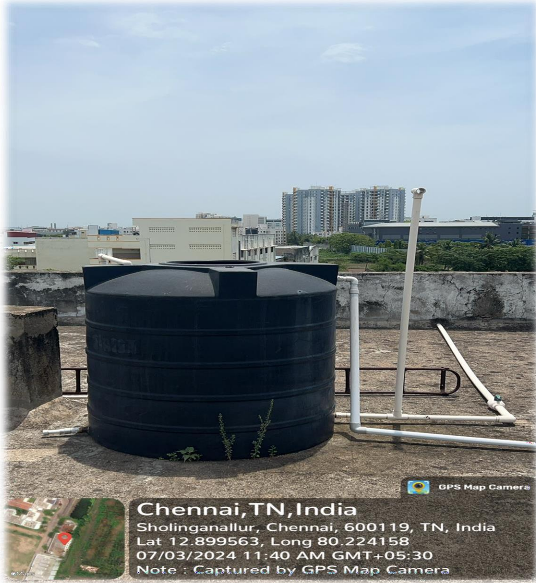
RO water tank MBA Building

An ISO 9001 : 2015 Certified Institution, Sholinganallur, Chennai -600 119.