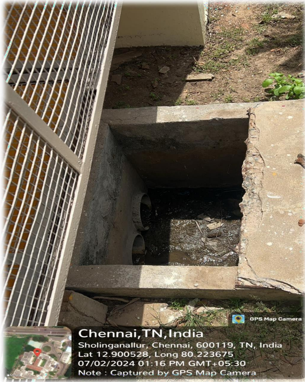
Rain Water harvesting percolation Pit

An ISO 9001 : 2015 Certified Institution, Sholinganallur, Chennai -600 119.