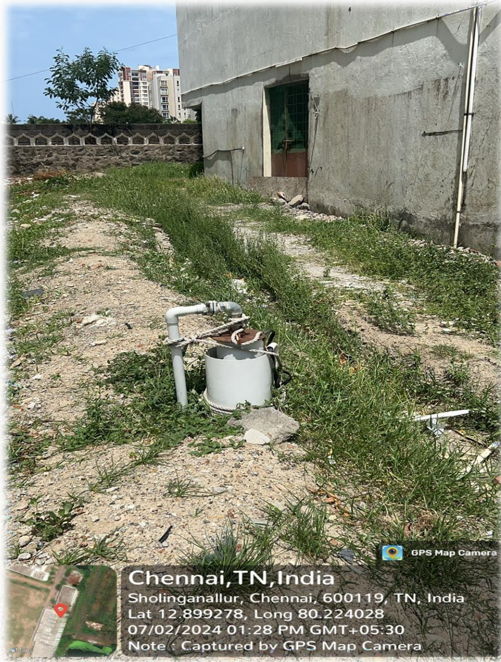
Borewell Near Building -2

An ISO 9001 : 2015 Certified Institution, Sholinganallur, Chennai -600 119.