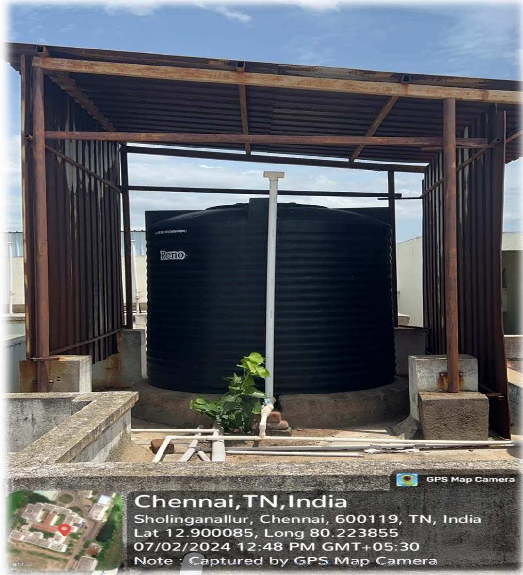
RO Water tank

An ISO 9001 : 2015 Certified Institution, Sholinganallur, Chennai -600 119.