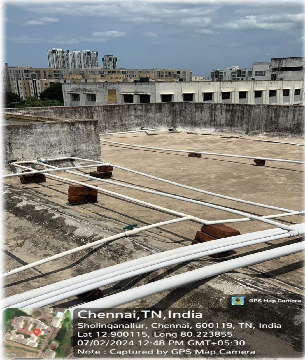
RO Plant @ Pipe line Water Distribution

An ISO 9001 : 2015 Certified Institution, Sholinganallur, Chennai -600 119.