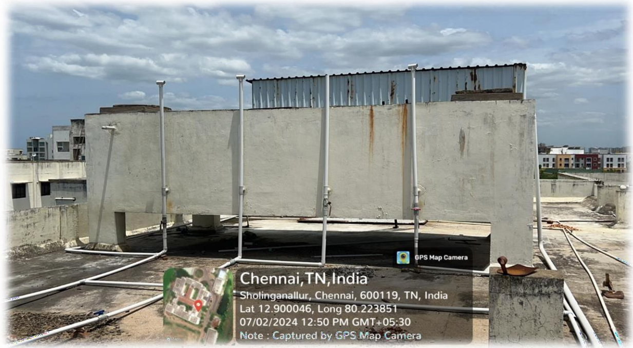
RO Plant @ water tank Main Building Annexure -1

An ISO 9001 : 2015 Certified Institution, Sholinganallur, Chennai -600 119.