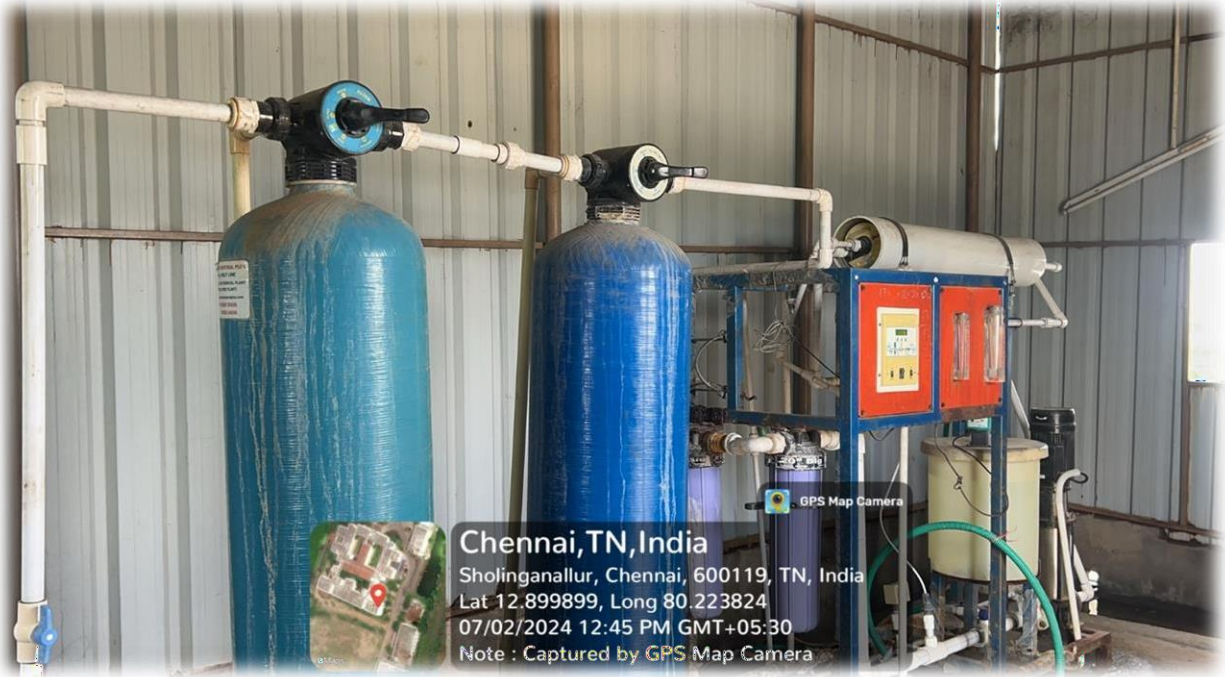
RO Plant @ Main Building

An ISO 9001 : 2015 Certified Institution, Sholinganallur, Chennai -600 119.