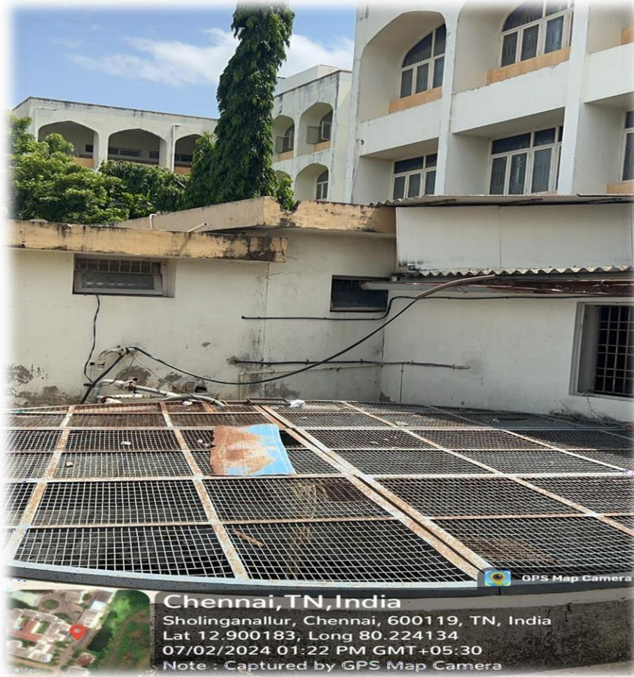
Open Well near Main Building

An ISO 9001 : 2015 Certified Institution, Sholinganallur, Chennai -600 119.