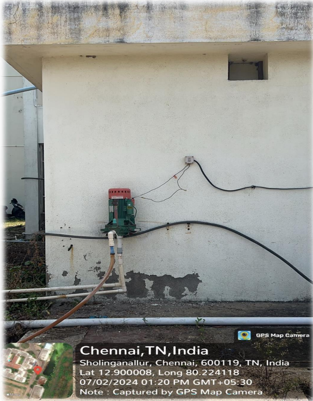
Borewell Motor Near Main Building

An ISO 9001 : 2015 Certified Institution, Sholinganallur, Chennai -600 119.